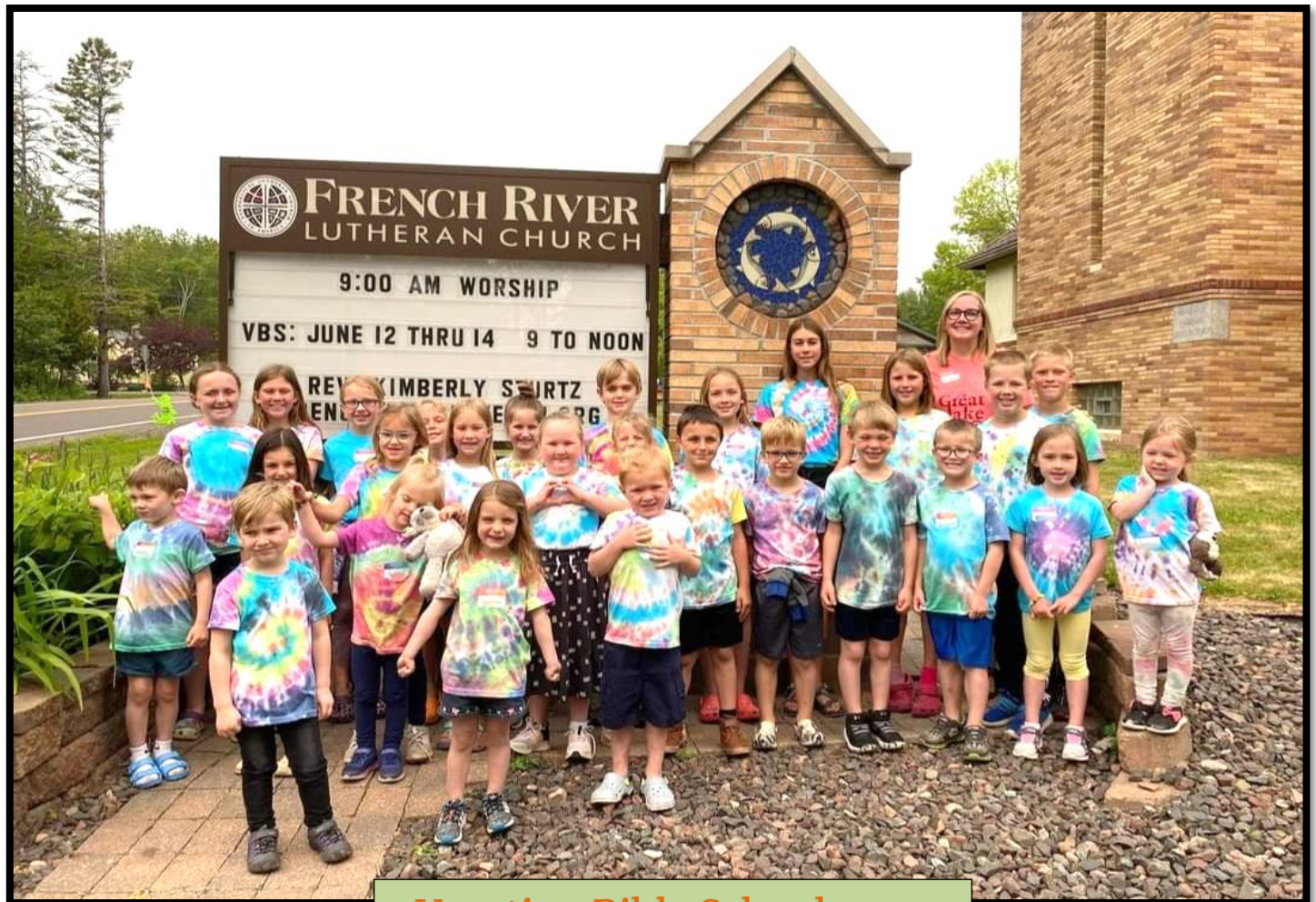
Vacation Bible School 2023