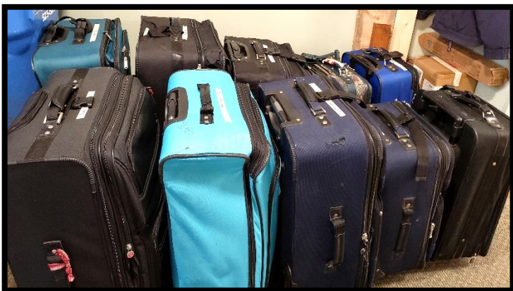
10 suitcases, packed and ready to go

Ten suitcases were picked up by Sue Thomson, a friend of Carol Surine's who is going to Iowa for a visit, for a relay-type of interim transfer. They were packed – oh, really packed! – into the trunk and back seat of the car, and our contact Ginny met her at the intersection of I-35 and Highway 20, west of